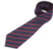
Hale School Tie