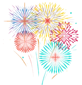
Fireworks night (Round table)