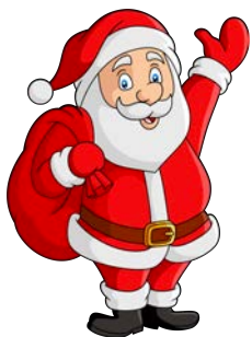
Christmas fair £1815.20