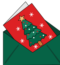
Christmas cards £136.50