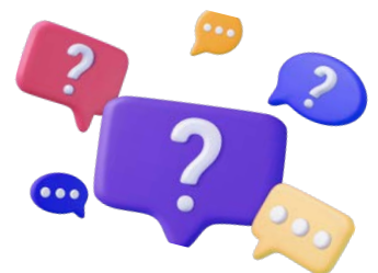
Quiz night £367.13