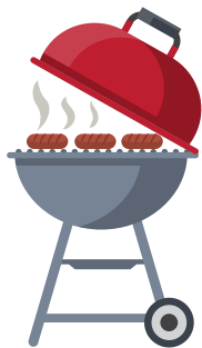
Welcome BBQ £398.60