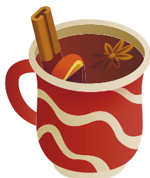
Nativity refreshments £236.68