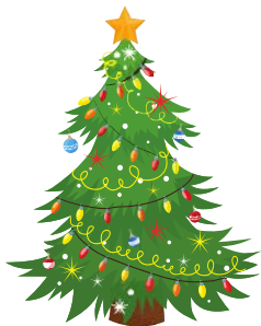
Christmas trees (Round table)