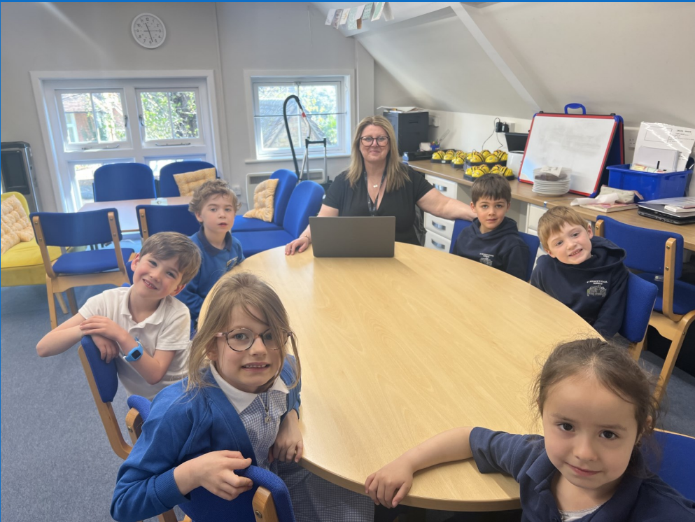
School Council meeting