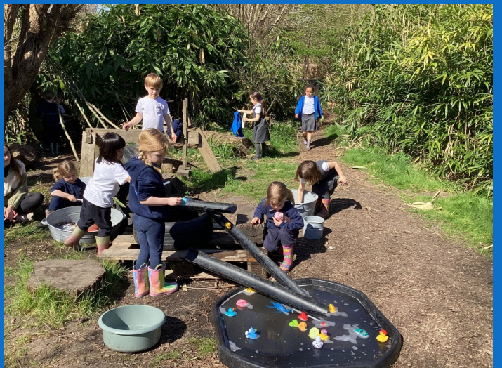
Easter fun at Space2Grow