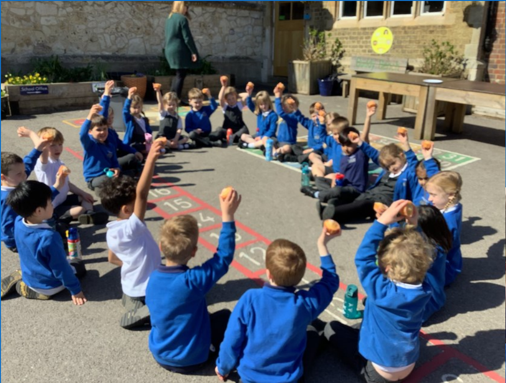
Easter Pause Day