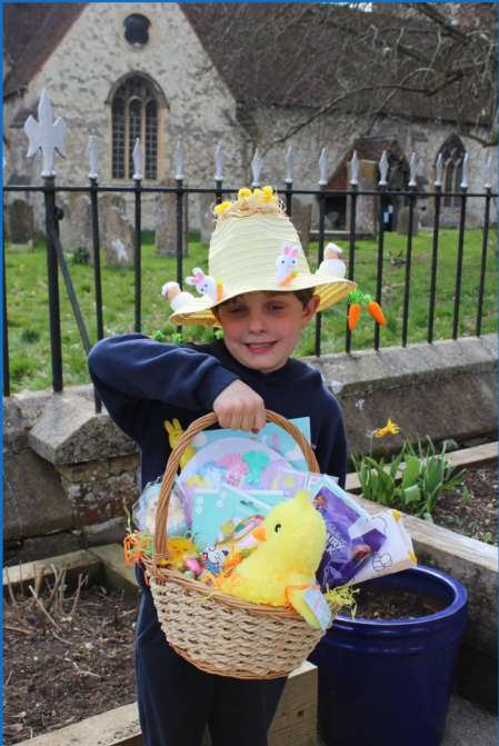
Winner of Easter Raffle