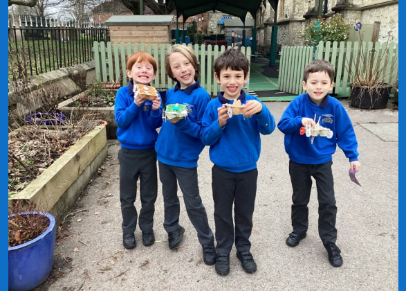
Making moon buggies