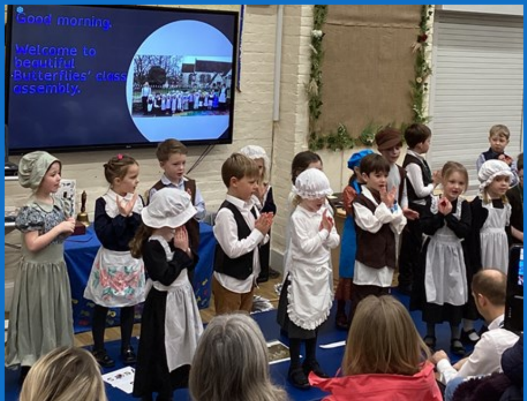
Butterfly Class Assembly