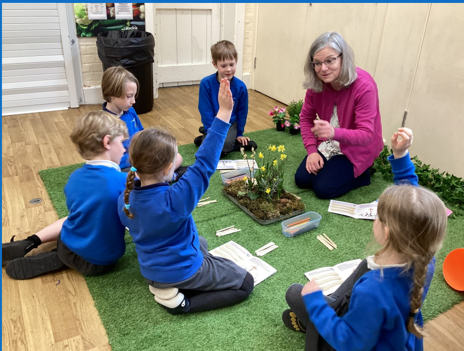
Signpost Assembly for Year 2