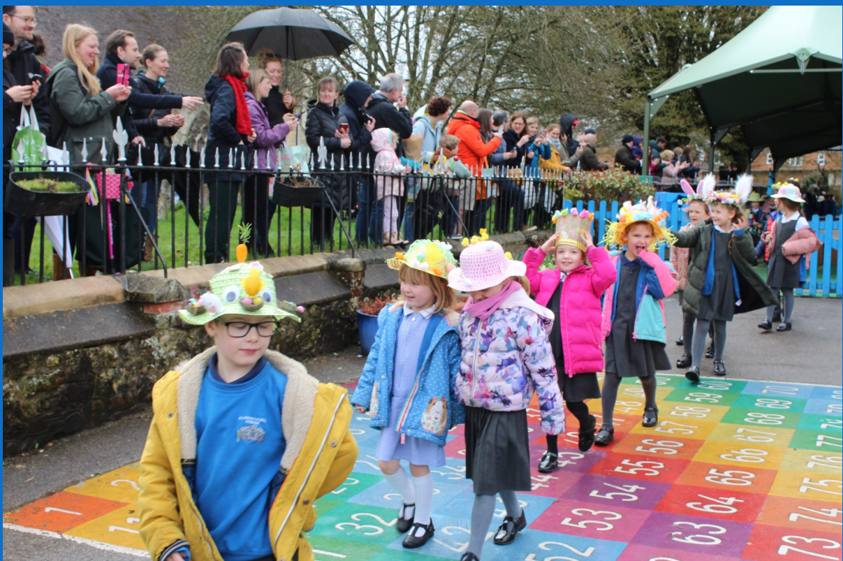
Easter Bonnet Parade ideas