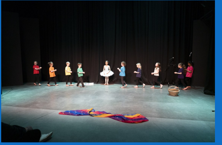
Farnham's Got Talent (official photos)