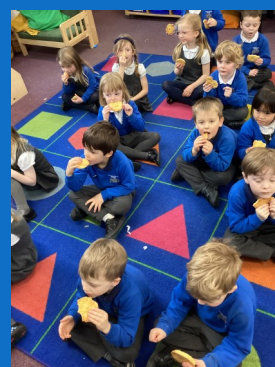
Food Tasting in Caterpillar Class